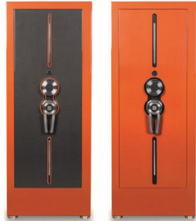
TURBO CARBON EDITION Grid orange

With several grinding, priming and polishing steps, ten layers of paint and the addition of special metal flakes the TURBO LACQUER impresses with its bright and expressive appearance. There are numerous color options available for your personal PODIUM.