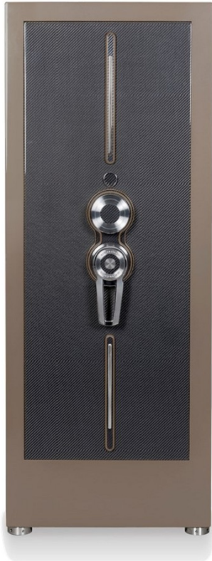
TURBO CARBON EDITION STIRLING GREY