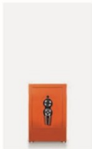
TURBO S 740 x 487 x 430 mm 155 kg

available in 4 different sizes we always have the right fit for you.