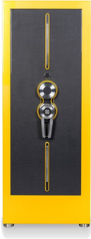
TURBO CARBON EDITION RACING YELLOW