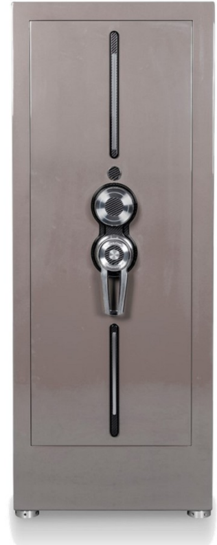
TURBO LACQUERED EDITION STIRLING GREY