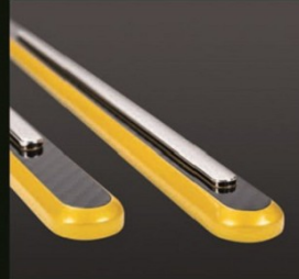
Twin Lanes detail Balance & Figuration