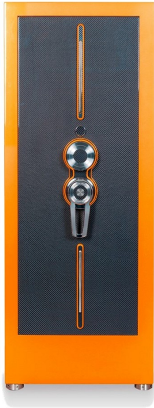
TURBO CARBON EDITION GRID ORANGE