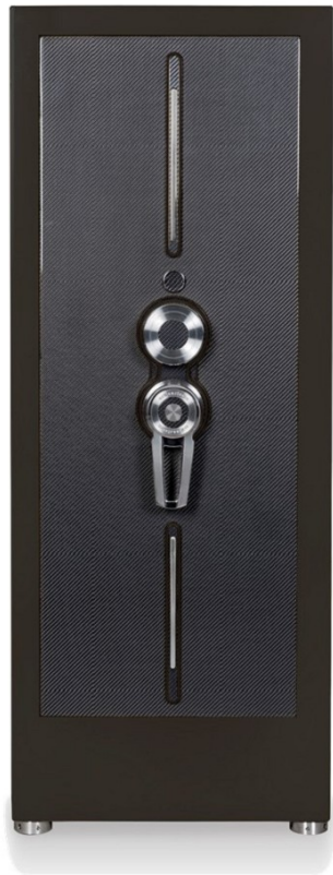
TURBO CARBON EDITION INFINITY BLACK