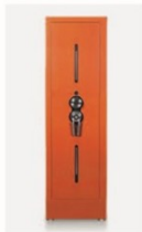
TURBO XXL 1587 x 487 x 430 mm 360 kg