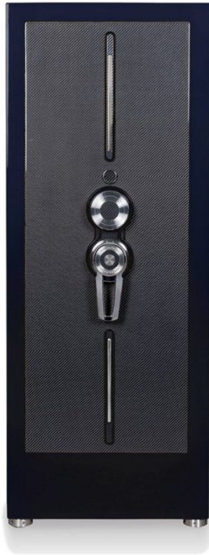
TURBO CARBON EDITION NIGHT BLUE