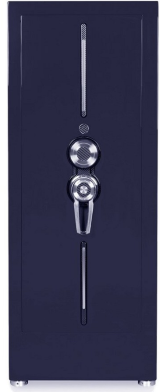
TURBO LACQUERED EDITION NIGHT BLUE