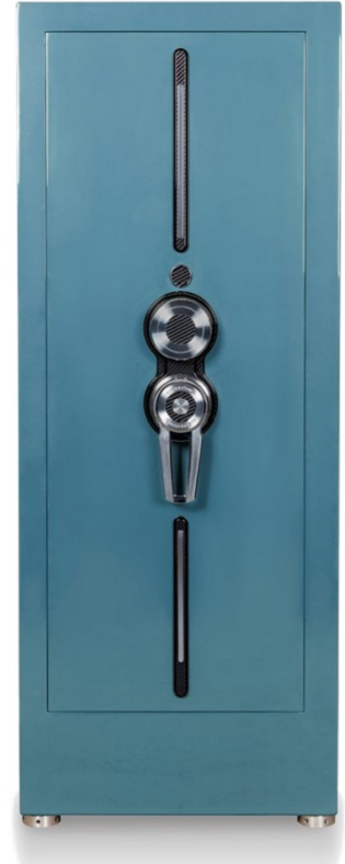
TURBO LACQUERED EDITION SHARK BLUE