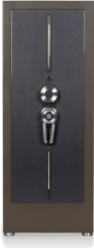
TURBO CARBON EDITION GT GREY