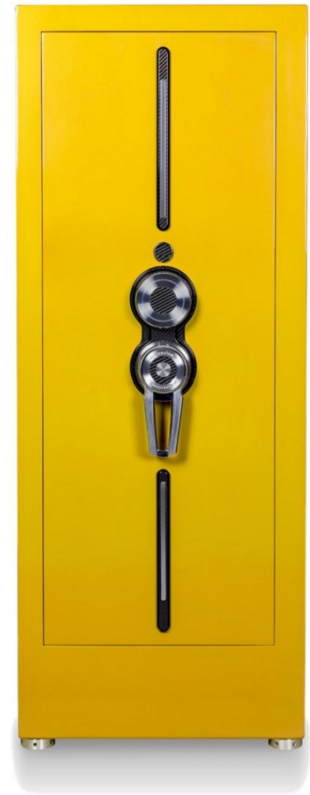
TURBO LACQUERED EDITION RACING YELLOW