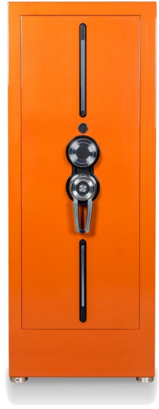
TURBO LACQUERED EDITION GRID ORANGE