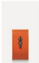
TURBO L 926 x 487 x 430 mm 220 kg