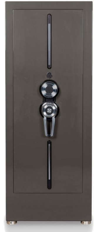
TURBO LACQUERED EDITION GT GREY