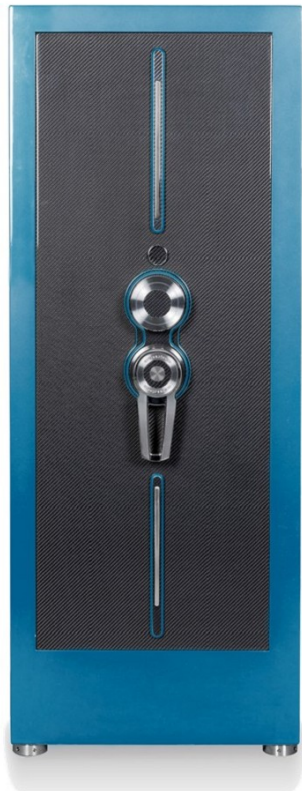
TURBO CARBON EDITION SHARK BLUE