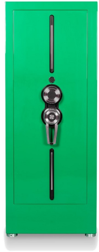
TURBO LACQUERED EDITION VIPER GREEN