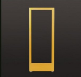
Monocoque detail Protection & Safety

experts developed every single element of the all new TURBO with one goal in mind: Stand out from the crowd!