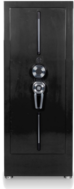
TURBO LACQUERED EDITION INFINITY BLACK