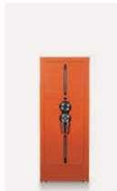
TURBO XL 1256 x 487 x 430 mm 290 kg