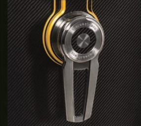
Grip detail Access & Control